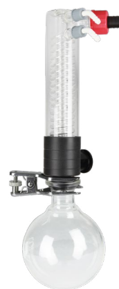
Exhaust vapor condenser (EK) (20751801)