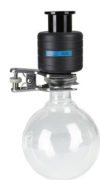
Inlet separator (AK) (20751802)