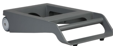
VACUU·PURE shuttle (20751800)